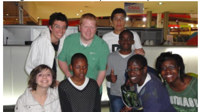
Youth Activity – bowling – February