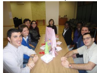
Young Adults' Valentine Banquet – February