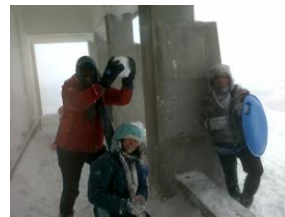
Winter Youth Camp – March

We have seen an increase in faithfulness among our current members and with that, an increase in overall attendance. We are very excited about what God will do this year!