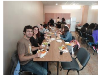
Church dinner – February